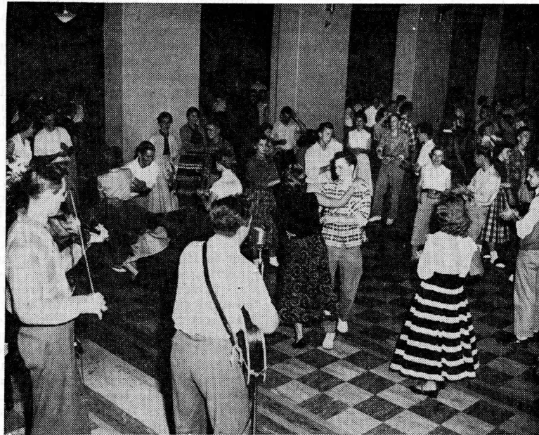
Class of '57 swinging their partners during last Orientation Week.