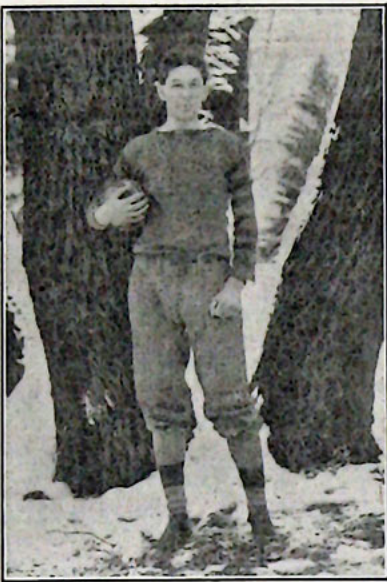
Captain and Left End of the Football Team and Captain and Center of the Basketball Five.