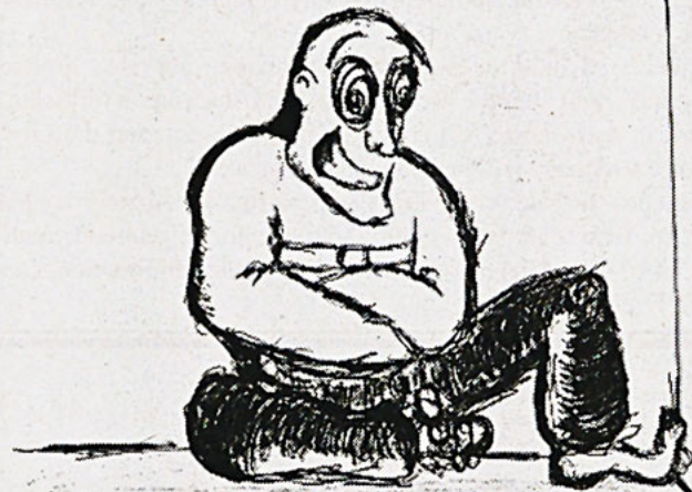
One day Harry figures it all out.