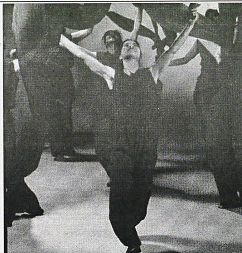
DANCE FEVER—The Lily Cai Chinese Dance Company will participate in the Centerstage Subscription Series on Saturday, March 31 at 7:30 p.m. in Shafer Auditorium.

The last person to leave crosses one of the numbers off the board and tears a link off the chain. One less day.