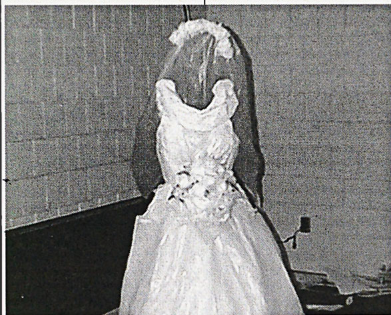
RECYCLED BRIDE—Students enrolled in Art in the Environment recently completed an "object transformation" assignment. Here, a student made a wedding dress out of plastic bags.