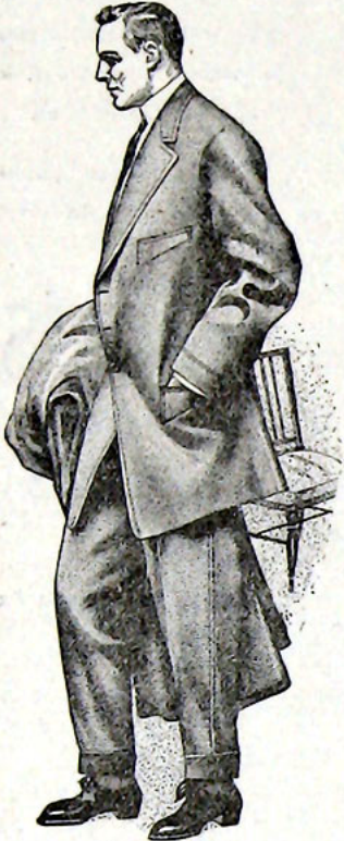
Copyright 1909 The House of Kuppenheimer Chicago

Whatever Your Wardrobe Needs We Supply--and Supply Well