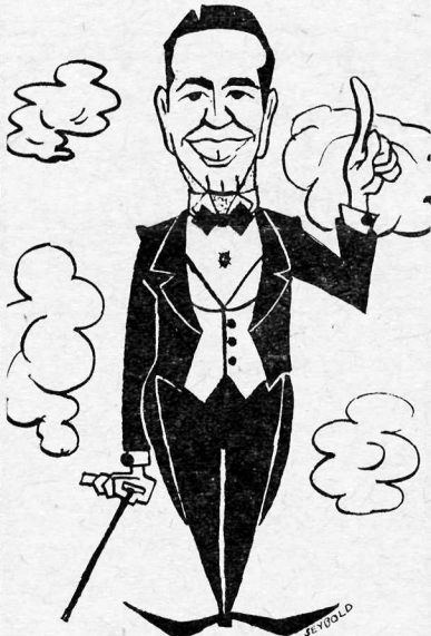
"And for my next miracle..."