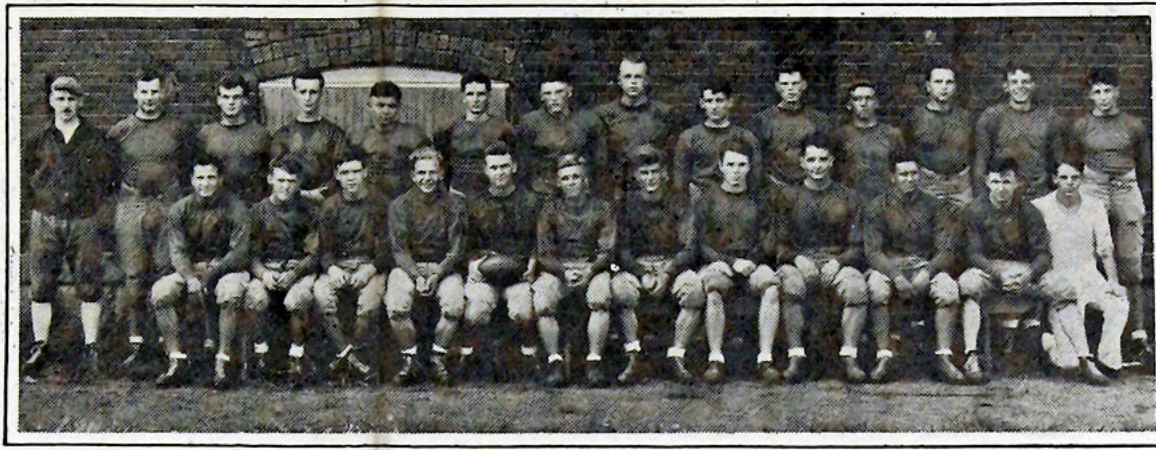
Allegheny's Football Squad, which will meet Geneva for Tri-State Championship Saturday.