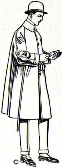
Society Brand Clothes

Special Showing of Noby English Suits, all the new effects at $18 and $20 Spaulding Sweaters, Stetson Hats, Manhattan Shirts